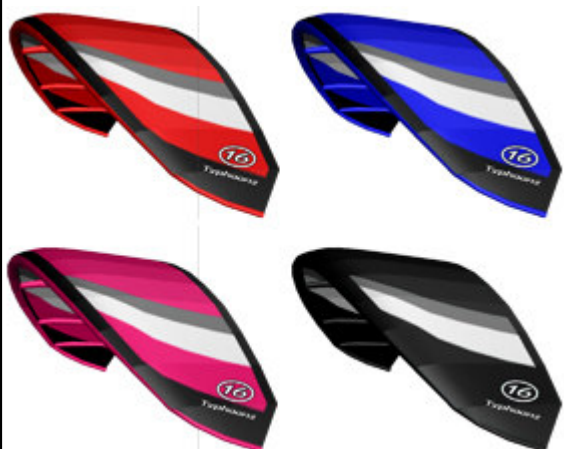
Available colors: Red, Blue, Pink & Black